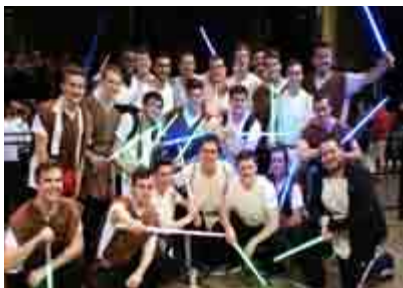
Brothers pose before participating in Greek Week 2016 Dance Competition

Another great thing Sig Ep has done for me is that it provided me with avenues to do things I would have never done on my own. From formal in Indianapolis (a city I never visited) to ski and rope climbing retreats and even an "Escape the Room", Sig Ep has shown me so many things that I've never done or seen and that may be my favorite part about it so far. Only one semester in and I love Sigma Phi Epsilon already. I cannot wait to see where the rest of them take me.