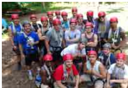
Brothers attend 2016 retreat at Summit Vision