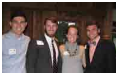
HALL OF FAME – 2016

Homecoming continues to be a great time to make plans to get together with your brothers as there is much to do that weekend and it is our key event each year.